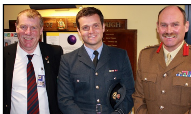
2012 signing of the Armed Forces Covenant by Rossendale Council